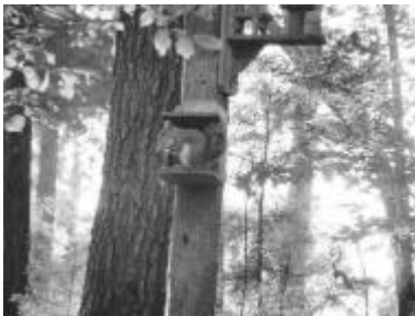
Chuck-a-Nut feeder filled with Wildlife Blend

Being both inquisitive and playful, squirrels seem to love the challenges of the various gizmos that people use. Available are squirrel swings, squirrel munch boxes, squirrel dinettes, and the Squngee. The squirrels' only concern seems to be, once they've finished one ear of corn, that another be installed in its place.